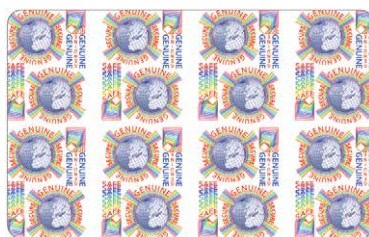
Evolis Genuine Globes Design